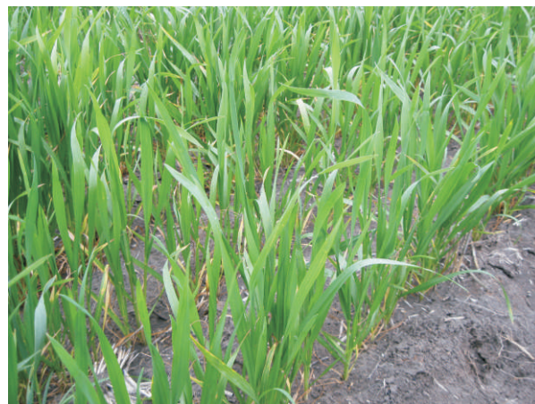
Photo 1. Symptoms that can be seen in a conventional wheat crop following a crop treated with imidazolinone herbicide. Ill thrift, yellowing in early growth, delayed heading by up to 4 days and reduced uptake of nutrients including nitrogen and zinc. Early symptoms of Clearfield® carry over can easily be confused with nutrient deficiencies.